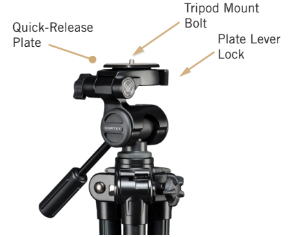
Flip the plate lever to lock/unlock plate.