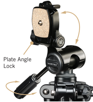
Control pan and tilt action with the handle.

You can control all of the pan and tilt action with just one hand. To make any horizontal or vertical adjustments, twist the handle counter-clockwise to free the pan head's movement. When in desired position, twist handle clockwise to lock.